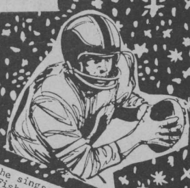
Bob - Thinks he sings; ex-member of the Sensitive Fish; the life of the party; the Blood & Guts of the Roach Motel; an obnoxious mof; has an average attention span of about 2 to 3 minutes... tops.