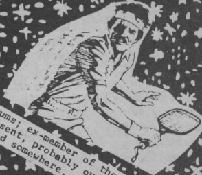
Frank -Drums; ex-member of the Bazookas; not present; probably out doing tons of speed somewhere.