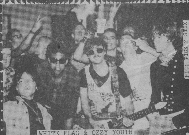
PIC: PICK 2 STIX