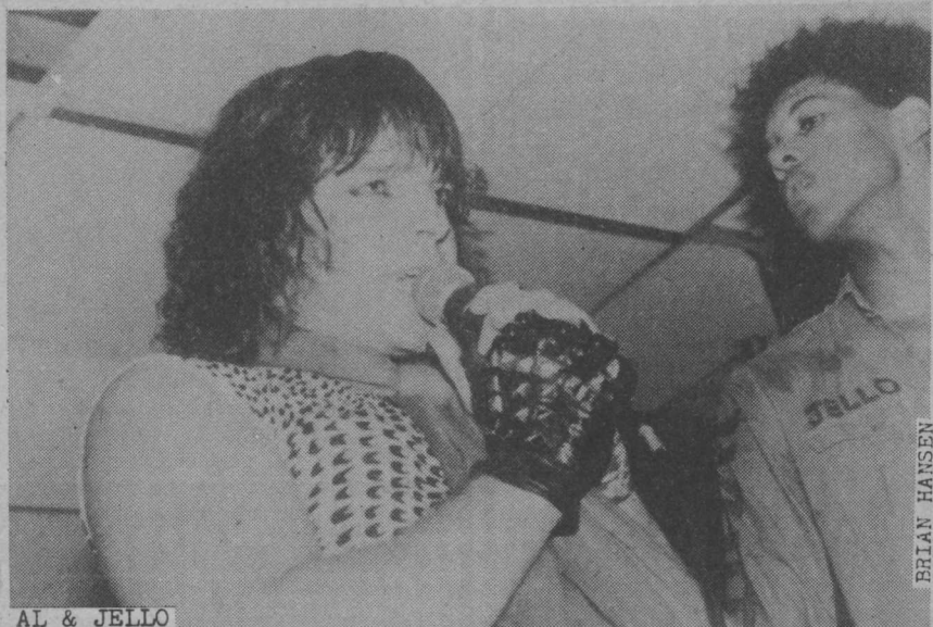
AL & JELLO

SR-How come you didn't enclose a lyric sheet like all the other bands do?